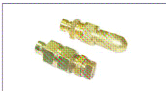
Interchangeable, Quick Connect Spray Tips: